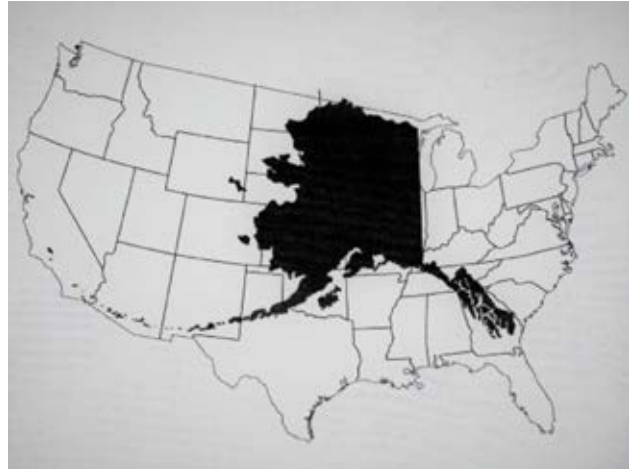
Alaska's actual size against the Lower 48 states